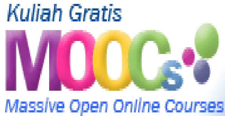
Figure 6: UT's MOOCs' Icon

MOOCs Universitas Terbuka launched on March 13, 2014 as part of a global warning Open Education Week. For UT, open to the public MOOCs program is a realization of the mission of UT is to build a culture of lifelong learning (lifelong learning). In addition, the provision of program MOOCs by UT, is an opportunity to introduce UT to the wider community with the provision of quality knowledge for free. This is in line with research findings that offer MOOC courses to improve the image of the profile of the institution (AHEAD, 2014).