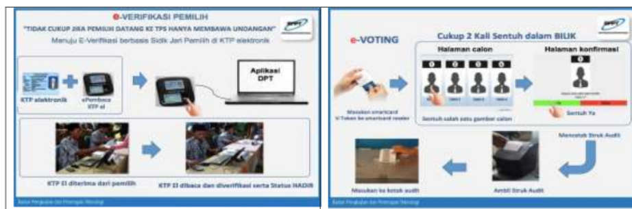
Figure 1. Voter e-verification and e-voting

replaced or abstention; (5) Thermal printers, namely a choice of paper printer. Without voter identity, this receipt paper is included in the Audit Box to be collected, stored and guaranteed confidentiality. This Audit Box is only opened if a dispute occurs.