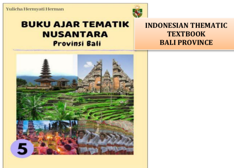
Figure 2. The example of the student submitted assignment (Indonesian version and English translation)

Prior to conduct the writing printed modular based learning materials tutorial, the students had to take pre-test regarding the entry knowledge of the writing skills. After pre-test the participants followed the tutorial session of the printed modular based learning materials writing. In this present study the participants took the post-test which related to the course objectives. The pre-test and post-test results were analyzed to get the information regarding the students gained knowledge and writing skills after learning with the mind map approach.